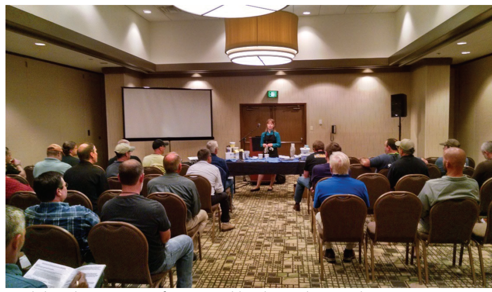
Workshop demonstration from Reynolds Advanced Materials

We had a very successful education program in Omaha this fall with 25 sessions that were a mix of presentations, workshops, and roundtable discussions. Our goal is to provide another rich program in Grand Rapids. There will be several "tracks" addressing topics that our members encounter in the workplace. These could include sustainability, professional