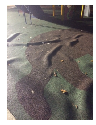
Figure 1 Before

By Ron May, Exhibits Supervisor, Brookfield Zoo