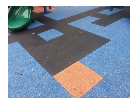
Figure 2 After

The new rubber flooring is 100% maintenance free. In the case of damage to a tile it can simply be removed & replaced without much effort. The new surface will offer a safe and fun space for kids to play for years to come.