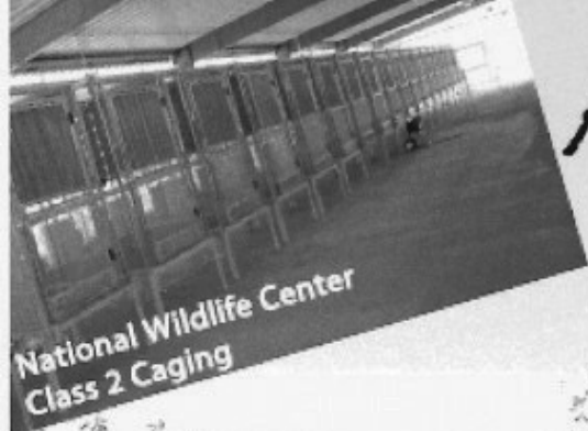
National Wildlife Center Class 2 Caging