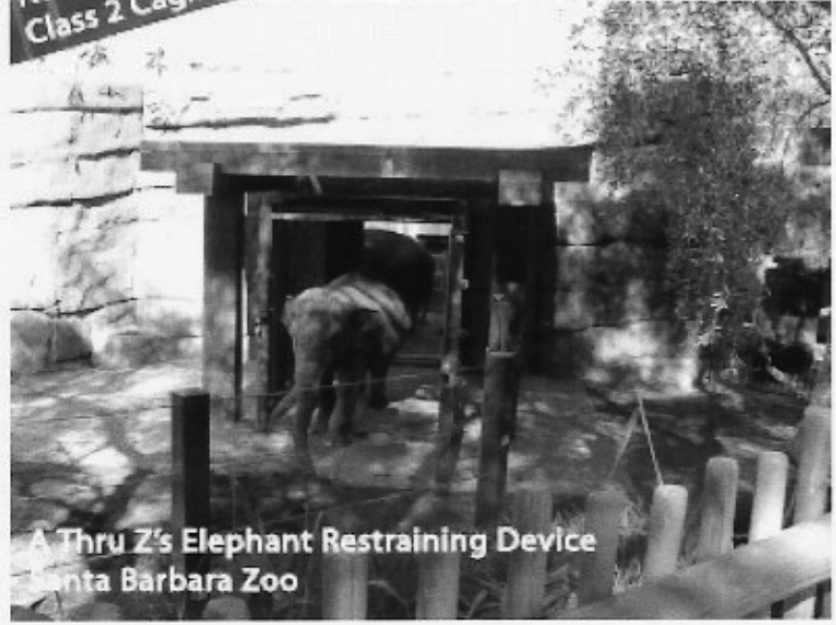
A Thru Z's Elephant Restraining Device Santa Barbara Zoo