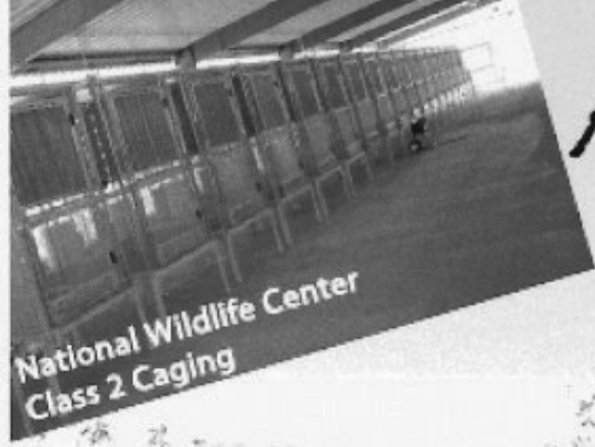
National Wildlife Center Class 2 Caging