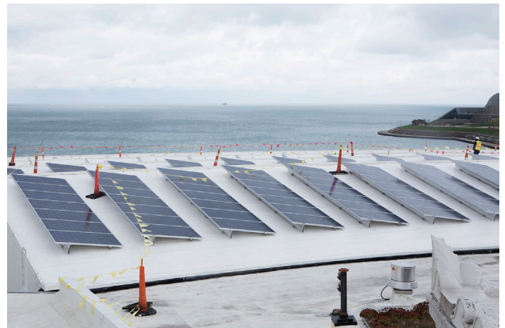
Solar panel installation

The aquarium has seen immediate results. In 2014, the aquarium cut its energy consumption by thirteen percent when compared to 2010. Each year, according to the Master Energy Roadmap plan, the goal is to save 10 million kilowatt-hours, enough energy to power 750 homes.