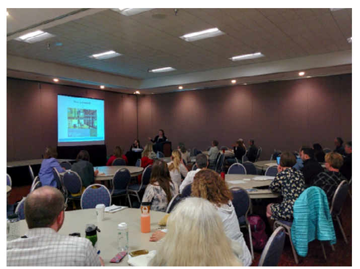
2017 Green Summit in Albuquerque, NM

This year's Green Summit will be packed with a lot of great information and resources to help you keep your institutions as sustainable as possible. I hope to see you there! If you might be interested in presenting at this year's Summit, or have questions in general, please contact me directly at fia@cincinnatizoo.org.