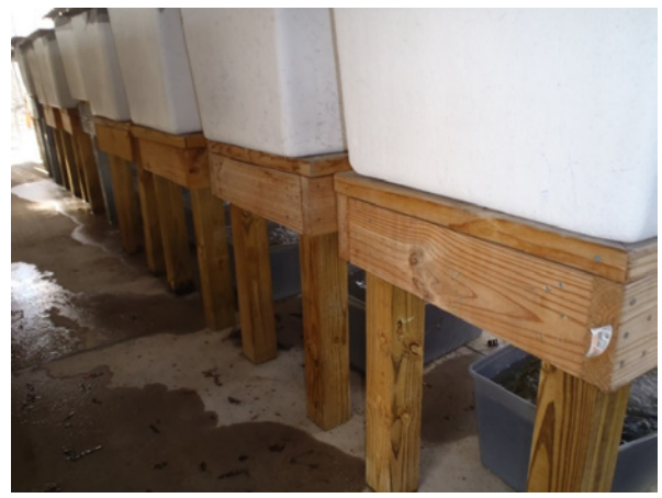
New Tank Stands