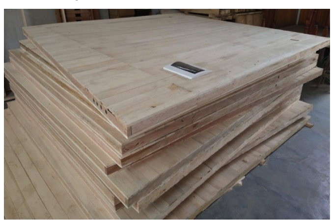
Infrastructure walls ready to be assembled.