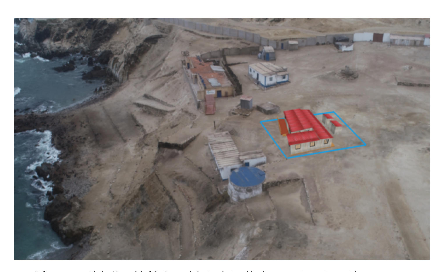
Reference map with the 3D model of the Research Station designed by the construction service provider.

Thank you for your support and patience. We will keep you updated!