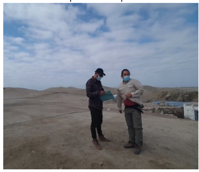
Our staff and the constructor evaluating the infrastructure location.

In the past months our Program has been in active coordi-nation with management of protected area for the instal-lation of our new Base Camp. The materials, design of the infrastructure, and work methodologies are designed to be friendly to the environment and reduce any kind of possible interference with the natural surroundings, as suggested in our meetings with the Servicio Nacional de Áreas Naturales Protegidas (SERNANP). SERNANP requested that to match other existing infrastructure, we make the housing from wood and wood-derived materi-als. They also requested we adjust the location to reduce the extent of the human foot print inside the reserve. This meant a change in location so there was more fieldwork to do to adjust to their requirement.