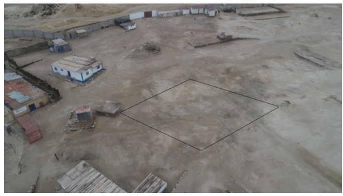
Area of the future infrastructure in RNSIIPG-Punta San Juan (black rectangle indicates the perimeter).

On October 22, 2021 Punta San Juan Program staff met via Zoom, with SERNANP personnel, to establish the final materials and location for this new infrastructure. In the first week of November 2021, our staff met with the con-structor in charge of this construction in the reserve. Dur-ing the visit they evaluated the area where the Punta San Juan Program Scientific Station will be installed, consider-ing the level of terrain and the development of an instal-lation plan. The future connections for water and sewage were also discussed. GPS coordinates were recorded to georeference the new area proposed by SERNANP and update the technical dossier for the government.