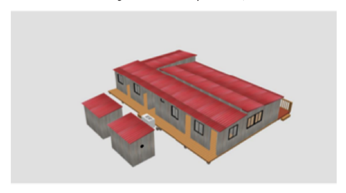
3D image of the exterior of the Research Station.